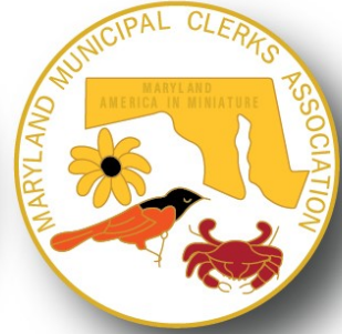
MMCA 2016 ART