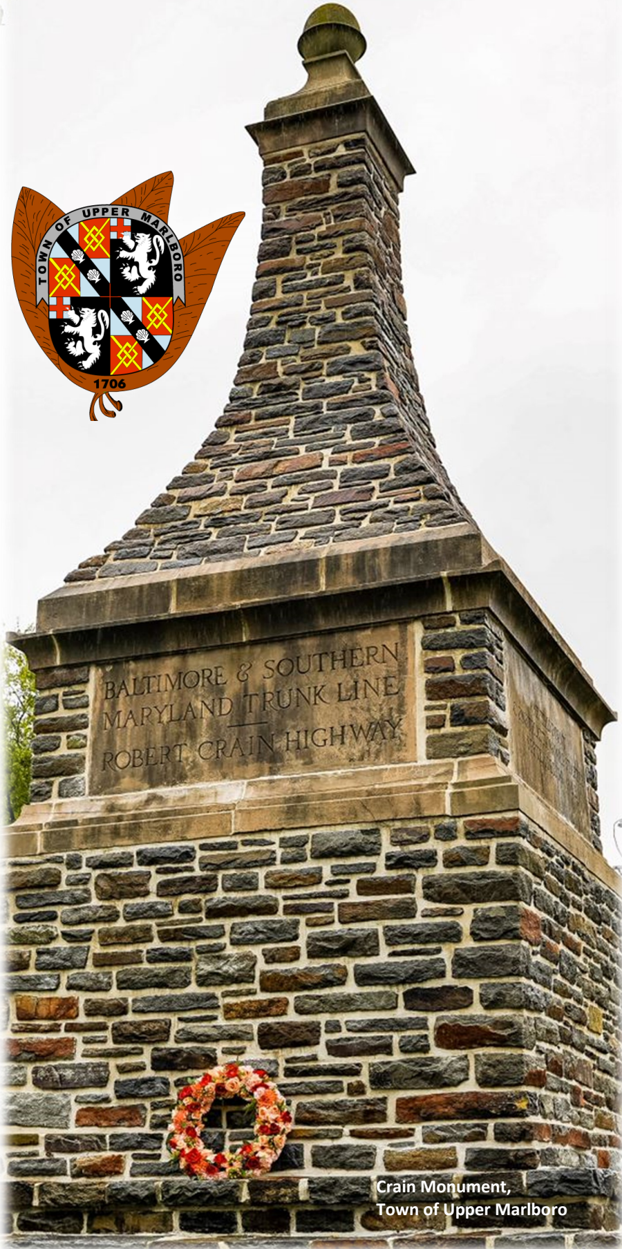
Crain Monument, Town of Upper Marlboro

The Town of Upper Marlboro has a downtown area along Main Street, which is home to a variety of local business as well as the Prince George's County Courthouse and the County Administration Building. The main Board of Education offices for the Prince George's County Public School system are a short walk from Main Street. Additional businesses and government offices are located in the Old Mill complex a short distance from downtown. The main residential area is the to the west of the downtown on several quiet streets. The Town has about 313 dwelling units, mostly single family homes with 657 official residents in according to the 2008 census. Numerous civic organizations in and near the town contribute to the sense of community and "small town" atmosphere that characterizes life in The Town of Upper Marlboro.