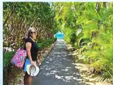
2021 winner Suzanne McNeel from Blackfoot, ID

With tickets available at $20 each or 3 for $50, take a chance ... or two or three! It's all for a good cause—furthering clerks' education through scholarships and IIMC education programs.