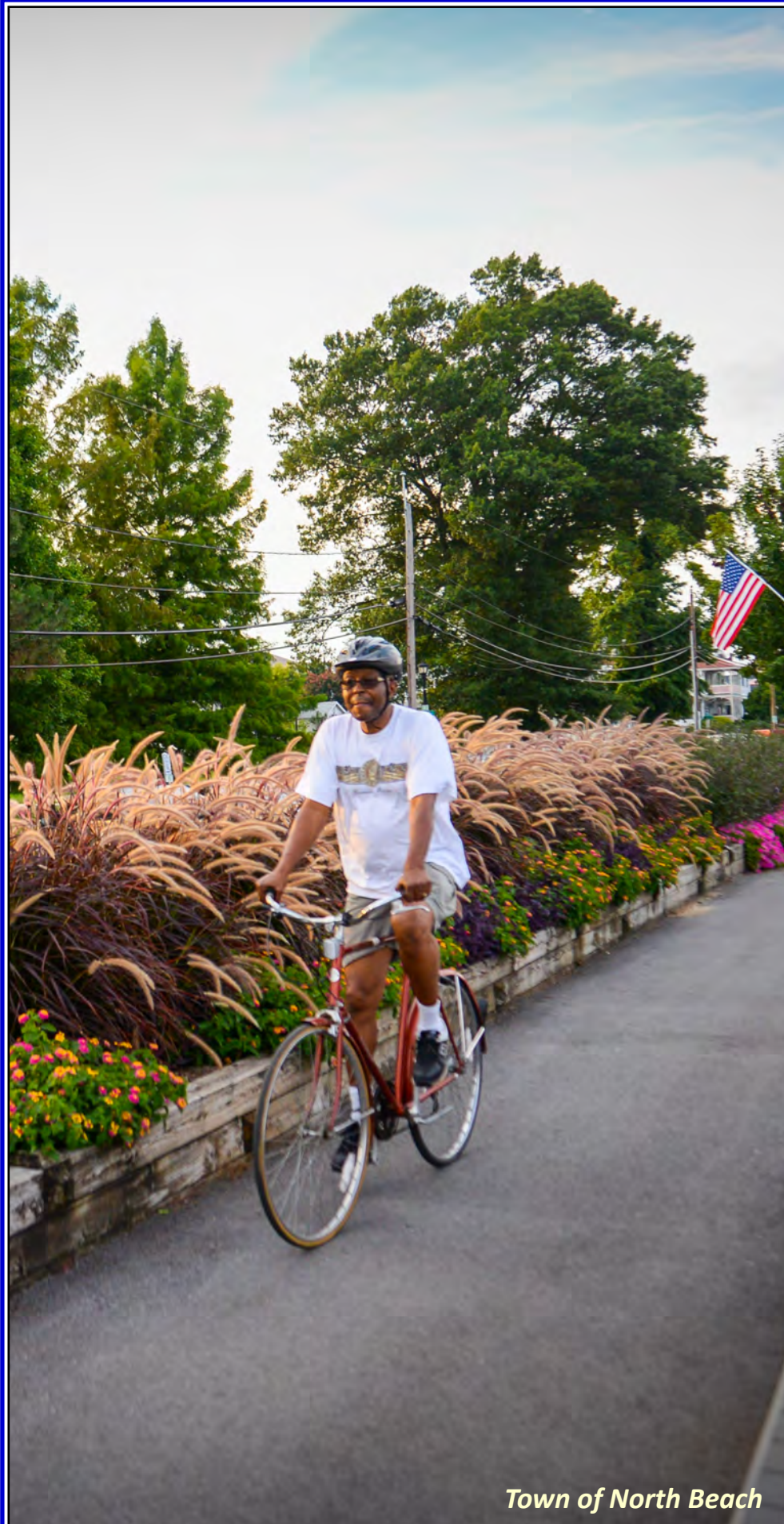
Town of North Beach